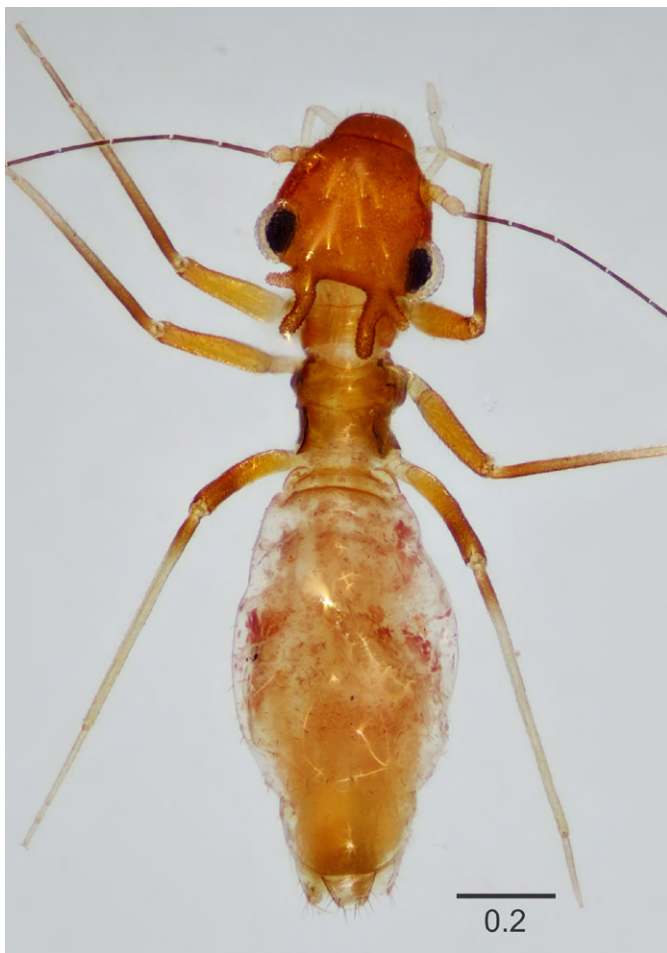
Figure 2. Dorsal habitus of Antilopsocus nadleri (female from Colombia). Scale in mm.

were taken with a filar micrometer with a measuring unit of 53 \mu\text{m} (Table 2).