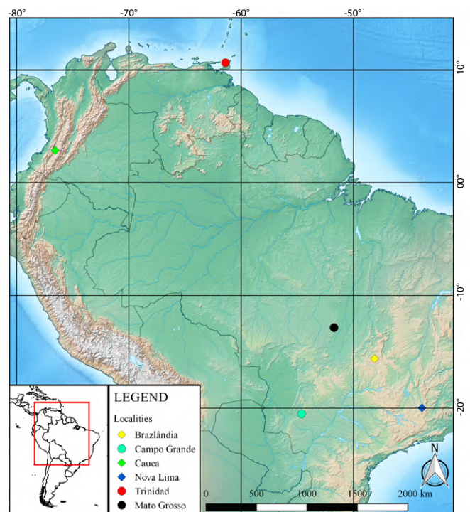
Figure 1. Map of South America showing the distribution of Antilopsocus nadleri Gurney, 1965. Circles correspond to previous records (Gurney 1965; New 1973), and diamonds correspond to new records.

We dissected and mounted one of our Colombian specimens in Canada balsam, following standard procedures (Figures 2–5), for comparisons with the measurements provided by Gurney (1965). Measurements of all specimens