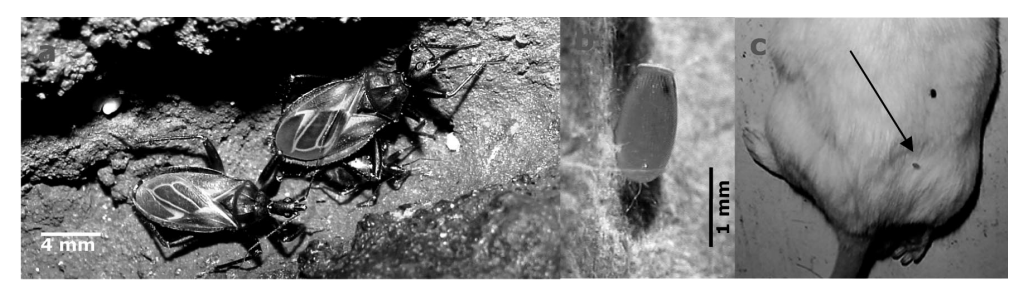
FIG. 2. (a) C. pilosa : eggs fixed on the cave wall, female, male, and nymph; (b) C. pilosa egg fixed on paper; (c) C. pilosa egg fixed on mouse.

served in the rainy season. The larger shaded area corresponds to a stream coming from the cave ceiling in a waterfall in the extreme south, running approximately 50 m until it reaches the southwest opening of the cave. The capture sites of C. pilosa correspond to areas with a high concentration of guano and bats with no noticeable light, where average temperatures ranged from 24 to 31°C and relative humidity from 62 to 80% (points 2 and 4). In places where there was guano but with high humidity (above 95%) no C. pilosa colony was found. All individuals were found above one meter high, occupying the entire wall until the ceiling, where the bat colonies were. Four species of bats were identified: Anoura geoffroyi Gray, 1838, Phyllostomus hastatus (Pallas, 1767), Carollia perspicillata (Linnaeus, 1758), all Phyllostomidae, and Pteronotus parnellii (Gray, 1843), Mormoopidae. The cave also contained about 50 arthropod species belonging to 20 orders, spread throughout the cave.